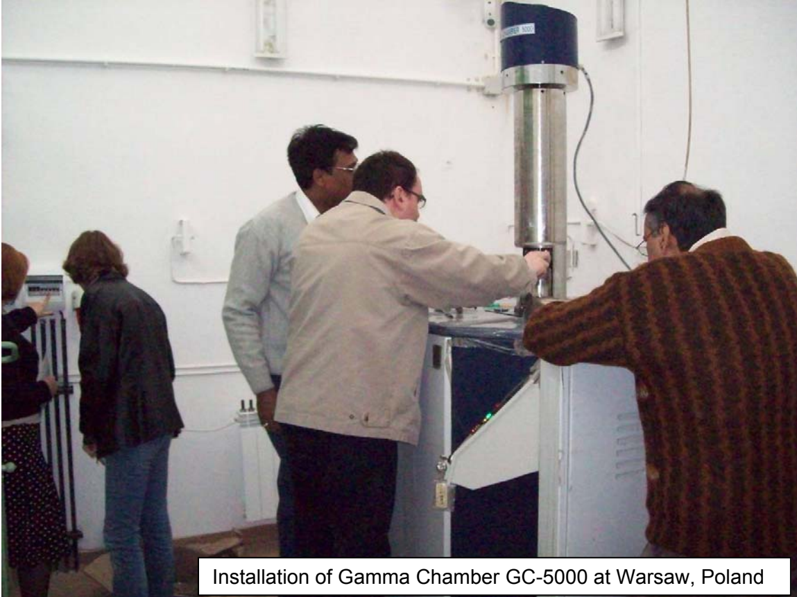
Installation of Gamma Chamber GC-5000 at Warsaw, Poland