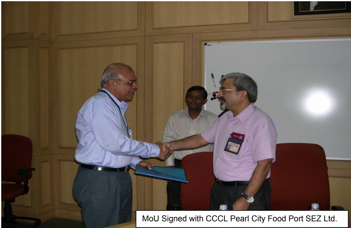
MoU Signed with CCCL Pearl City Food Port SEZ Ltd.