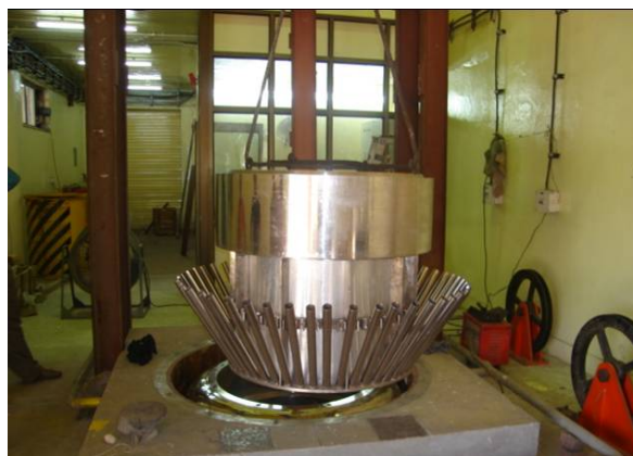
Install and Operate Irradiator being installed.

The civil work for the irradiator is completed. EOT crane has been installed. The fabrication of components is completed and installation is in progress.